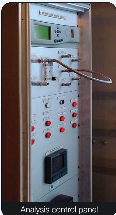
Analysis control panel

All types of gases or gas mixtures can be catered for.